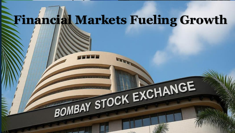
Financial Markets Fueling Growth