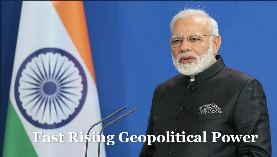
Fast Rising Geopolitical Power