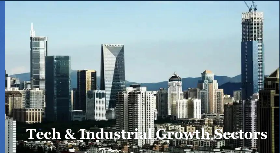
Tech & Industrial Growth Sectors